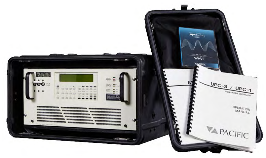
Transit case with front cover removed & operation manuals