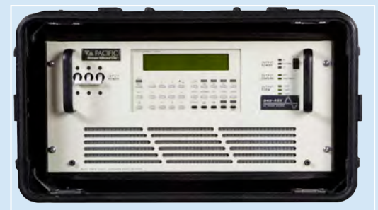
5U Transit case with front cover removed showing 345ASX-UPC3 front panel