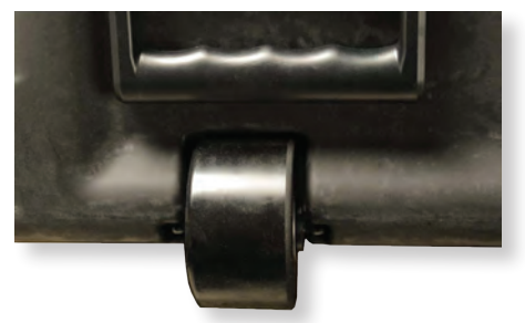
Integrated nylon ball-bearing wheels