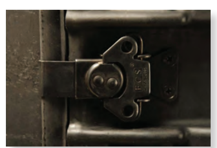
Stainless steel latches